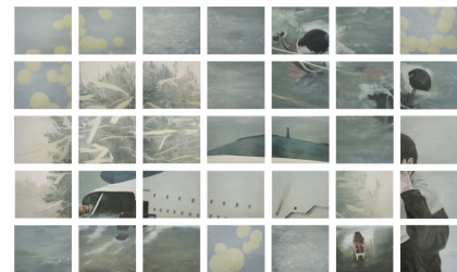
Pieces of Sewol | 2016 | Öl auf Leinwand | 190 x 332 cm