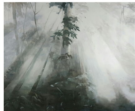
Epu'lu. March 21.2010 | 2016 | Öl auf Leinwand | 160 x 190 cm